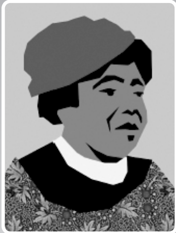
Fannie Lou Hamer

Celebrating the life and times of four powerful African American women.