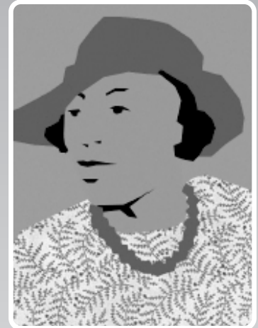
Zora Neale Hurston

Tuesday, March 6 11 am & 7 pm (Free) ($10/seat)