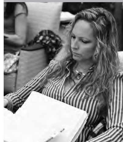
Life experience may translate into college credits.

Students should feel free to contact the Office of Prior Learning Assessment directly with any questions and/or concerns regarding chal-